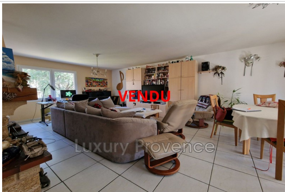
Villa 2462 Mimet

NEW FOR SALE IN MIMET - NEW BASTIDE Exclusively I present to you this property of approximately 175m2, currently rented 1745€/month until August 2023. On one level you will find a first house comprising a large living/dining room, semi-open kitchen, bathroom and 3 bedrooms. The whole decorated with a pretty veranda. Accessible from inside and outside, the lower part (on one level on the lower garden), you will find the second house comprising a living room, a bedroom, a suite, a kitchen and a bathroom. The plot of approximately 800m2 gives you the benefit of two separate spaces, a garage and a cellar. Two parking spaces in front as well as 2 or even 3 inside. To discover without delay by calling Alexandre at 0648702291 or Bérengère at 0688607071.