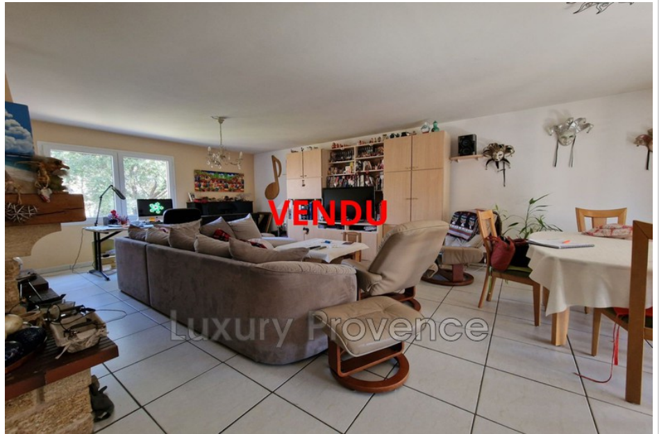
Villa 2462 Mimet

NEW FOR SALE IN MIMET - NEW BASTIDE Exclusively I present to you this property of approximately 175m 2 , currently rented 1745€/month until August 2023. On one level you will find a first house comprising a large living/dining room, semi-open kitchen, bathroom and 3 bedrooms. The whole decorated with a pretty veranda. Accessible from inside and outside, the lower part (on one level on the lower garden), you will find the second house comprising a living room, a bedroom, a suite, a kitchen and a bathroom. The plot of approximately 800m 2 gives you the benefit of two separate spaces, a garage and a cellar. Two parking spaces in front as well as 2 or even 3 inside. To discover without delay by calling Alexandre at 0648702291 or Bérengère at 0688607071.